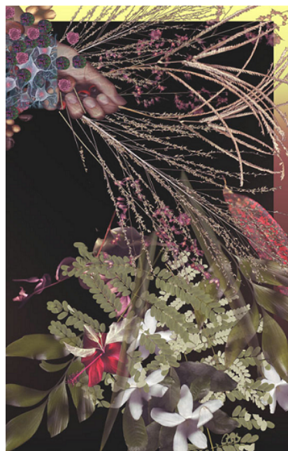
Artwork by Natalia Wilkins '12.

"The inspiration for my art work come from nature and how humans are just one part of a bigger picture. It is not often thought of how reliant living beings are on the small seemingly insignificant mechanisms that run the world. One small thing combines to create something larger and more impressive. The artwork shows that there is interconnectivity between every aspect of life. Without cells there cannot be life, without life there cannot be plants, without plants there wouldn't be food and without food there would be no wonders of the world. Everything people tend to take for granted or forget about is crucial to their survival and prosperity. My artwork hopes to remind the viewers of this complex web that sustains us."