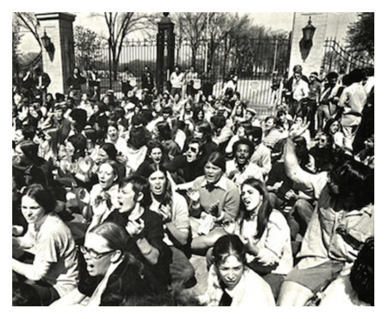
Lake Forest College Archives and Special Collections, Stentor , Vol. 84, No. 26.

Action published the Black Rap , a newsletter/literary journal that was distributed to 500 schools across the country and internationally.<sup>4</sup> These years were highly transformative for the college, and laid the foundation for many of the active student groups and outreach projects still in place today.