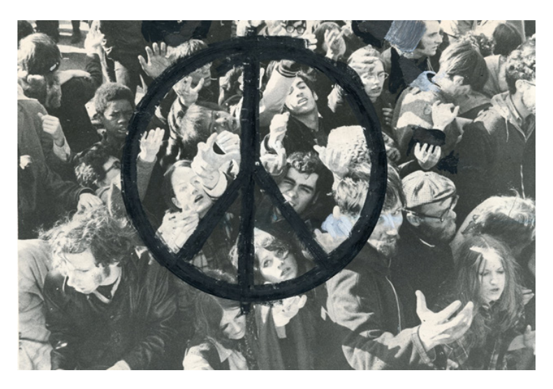
Lake Forest Archives and Special Collections, Photograph Collections, Box 92, Folder 8.

to the exhibit with a scrolling slideshow of bonus pictures. This exhibit and the research that went into it barely scratches the surface of the resources available in the Lake Forest College Archives and Special Collections, the school's art collection, and its strong alumni network. There's so much more to learn and uncover, and my hope is that this exhibit will inspire other students to do some of their own digging into the school's past. Especially in today' political environment, the visibility of this history is very important. Lake Forest College is very much a part of the world around it.